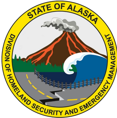
DHSEM Updated Logo