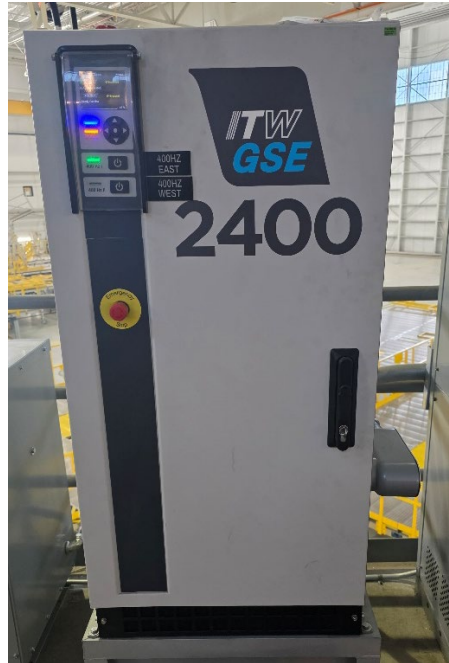
Figure 1. Existing 400Hz GPU.