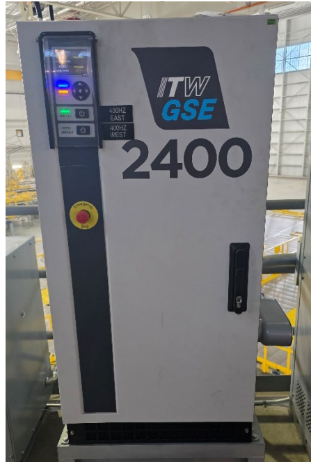
Figure 1. Existing 400Hz GPU.