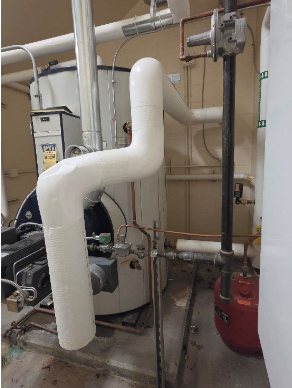
Figure 3. Existing Water Heater