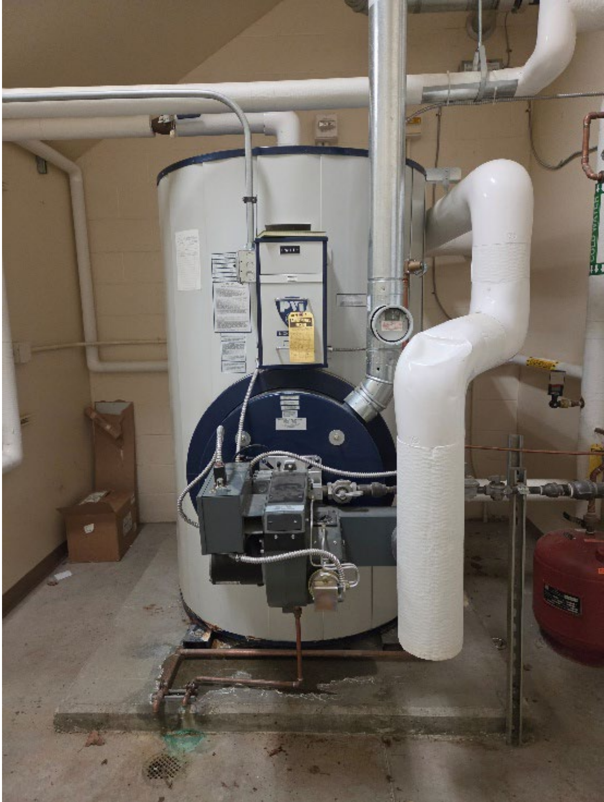
Figure 2. Existing Water Heater