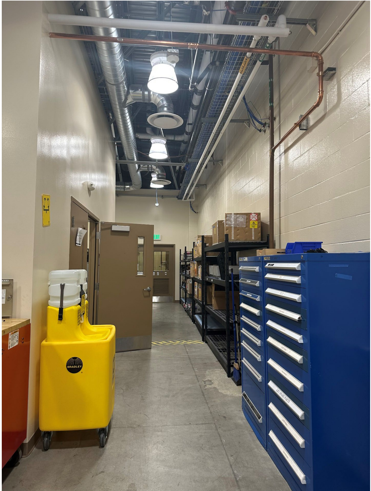
Figure 1 - Temporary EWS location