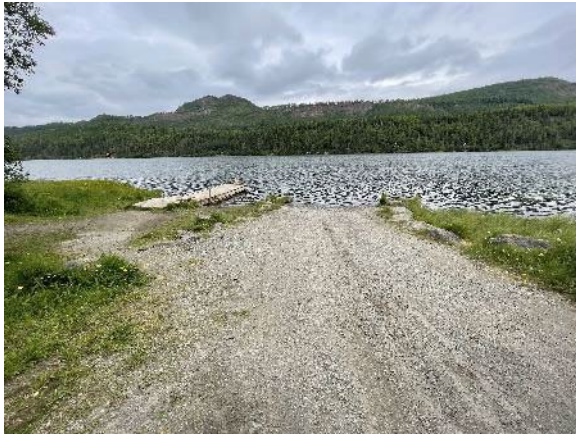
Mooring dock and boat ramp.