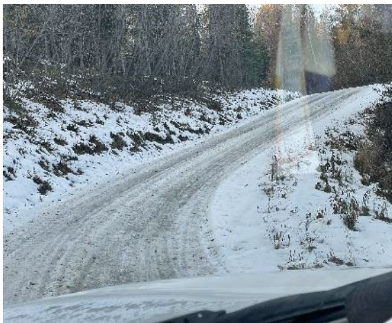
Steep Access Road. (Bonnie Lake Road).