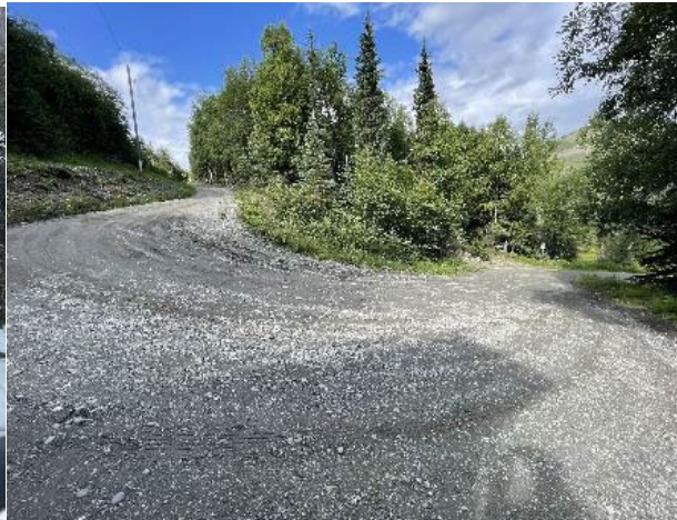
Sharp Turn on Bonnie Lake Road.