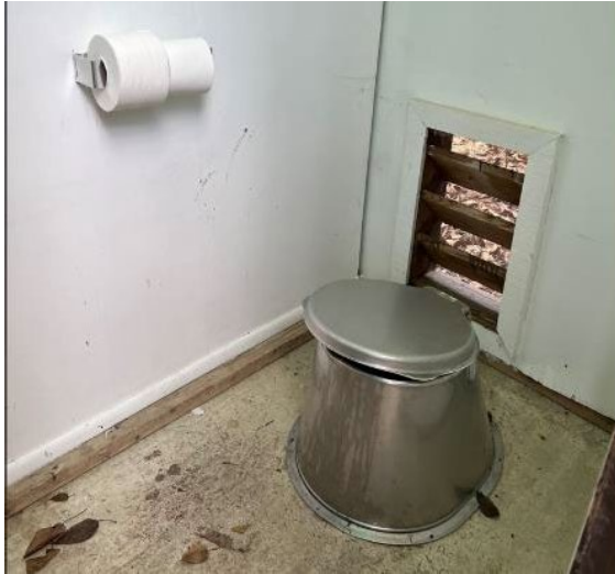
Pit Toilet Interior.