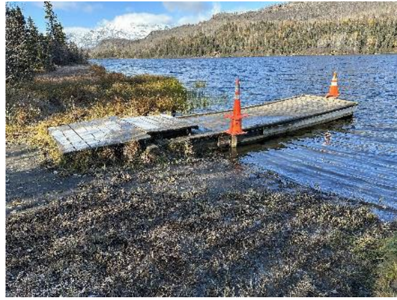
Deteriorating mooring dock .