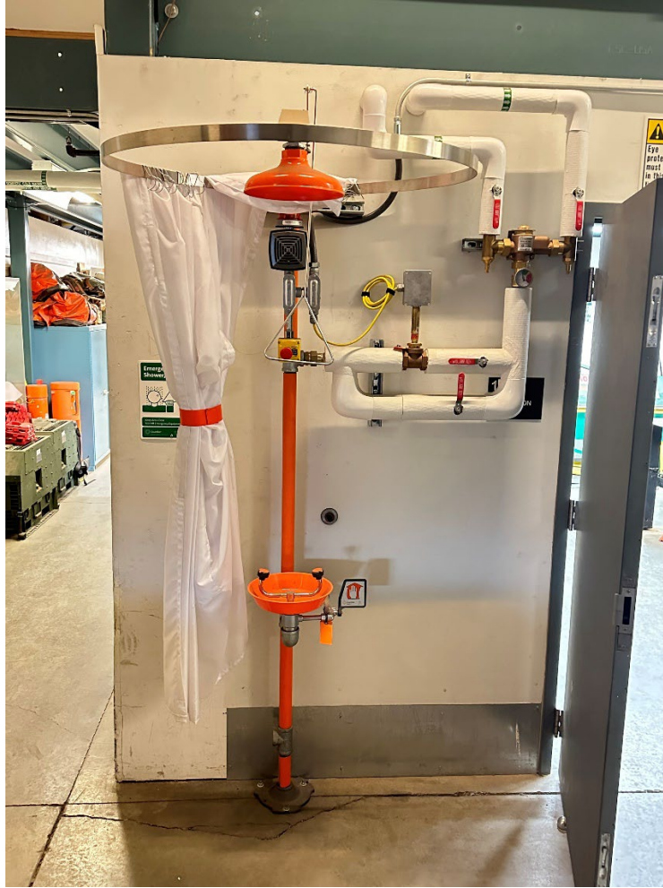
Figure 4- Complete Shower + EWS combo for Reference