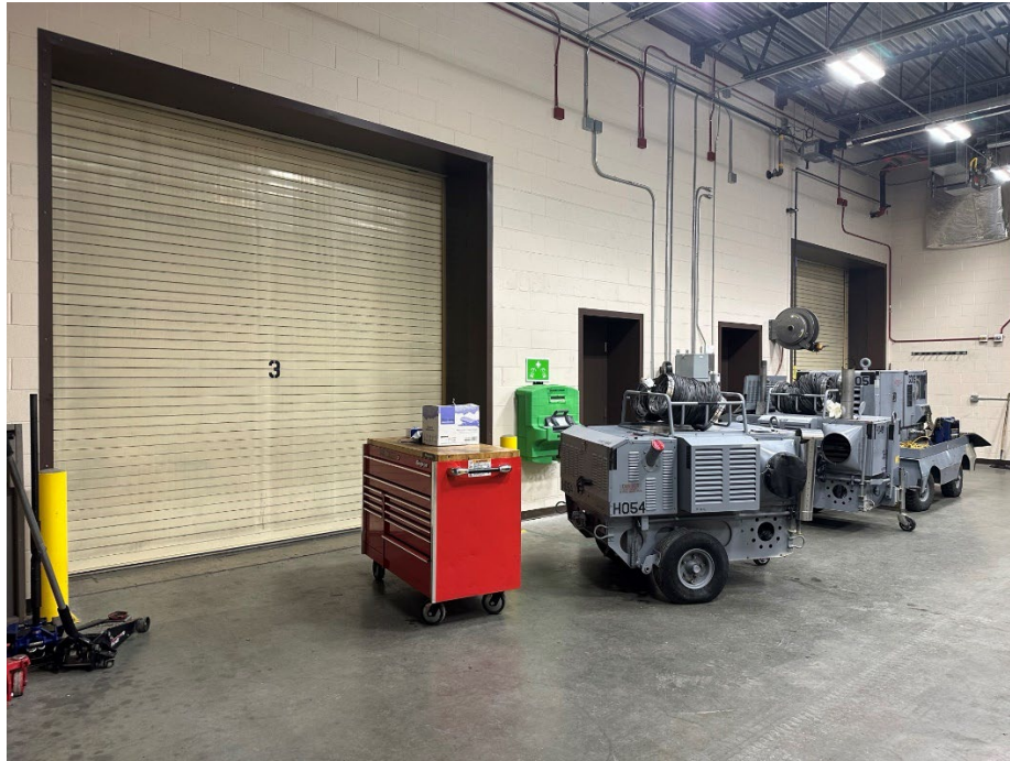
Figure 1 - Temporary EWS # 1