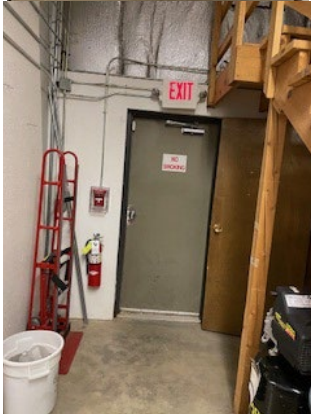
Significant water leaks in this area.