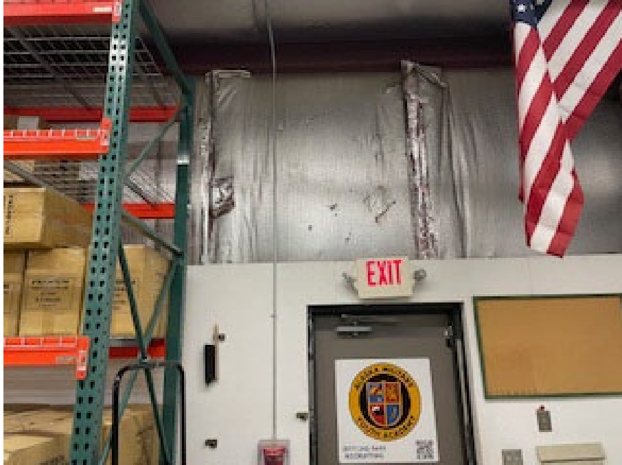
Main personnel door. Significant water leaks in this area.