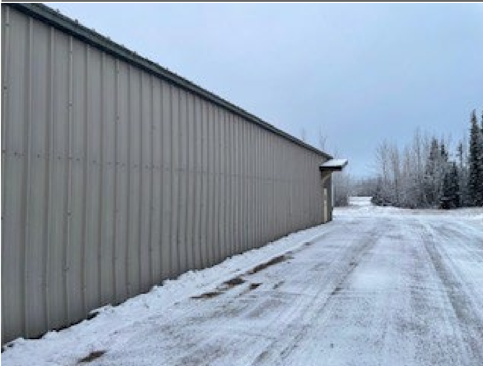
Roof and Siding