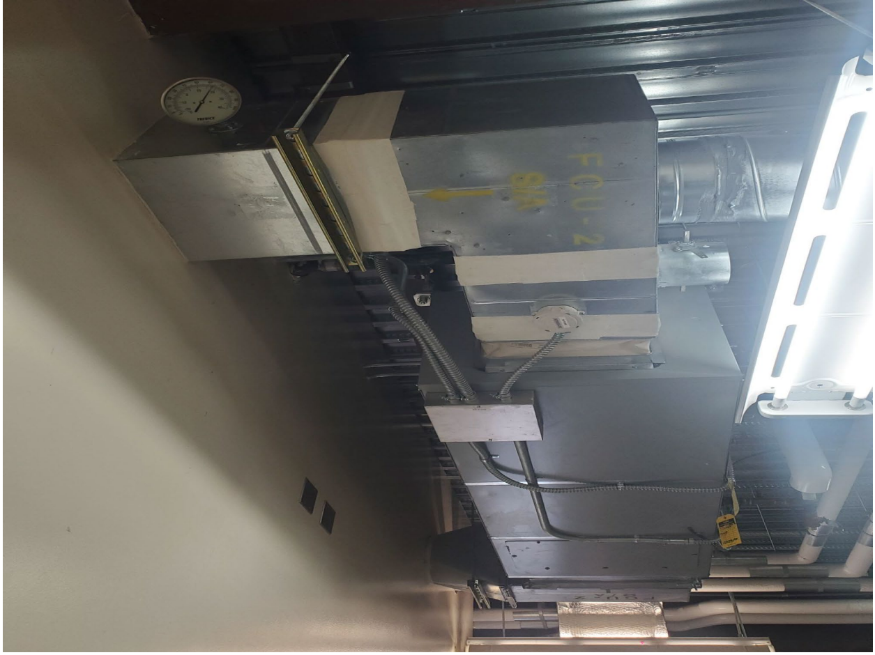
FCU-2 East View