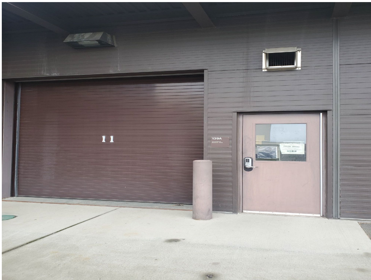
139A Munitions Shop Entrance