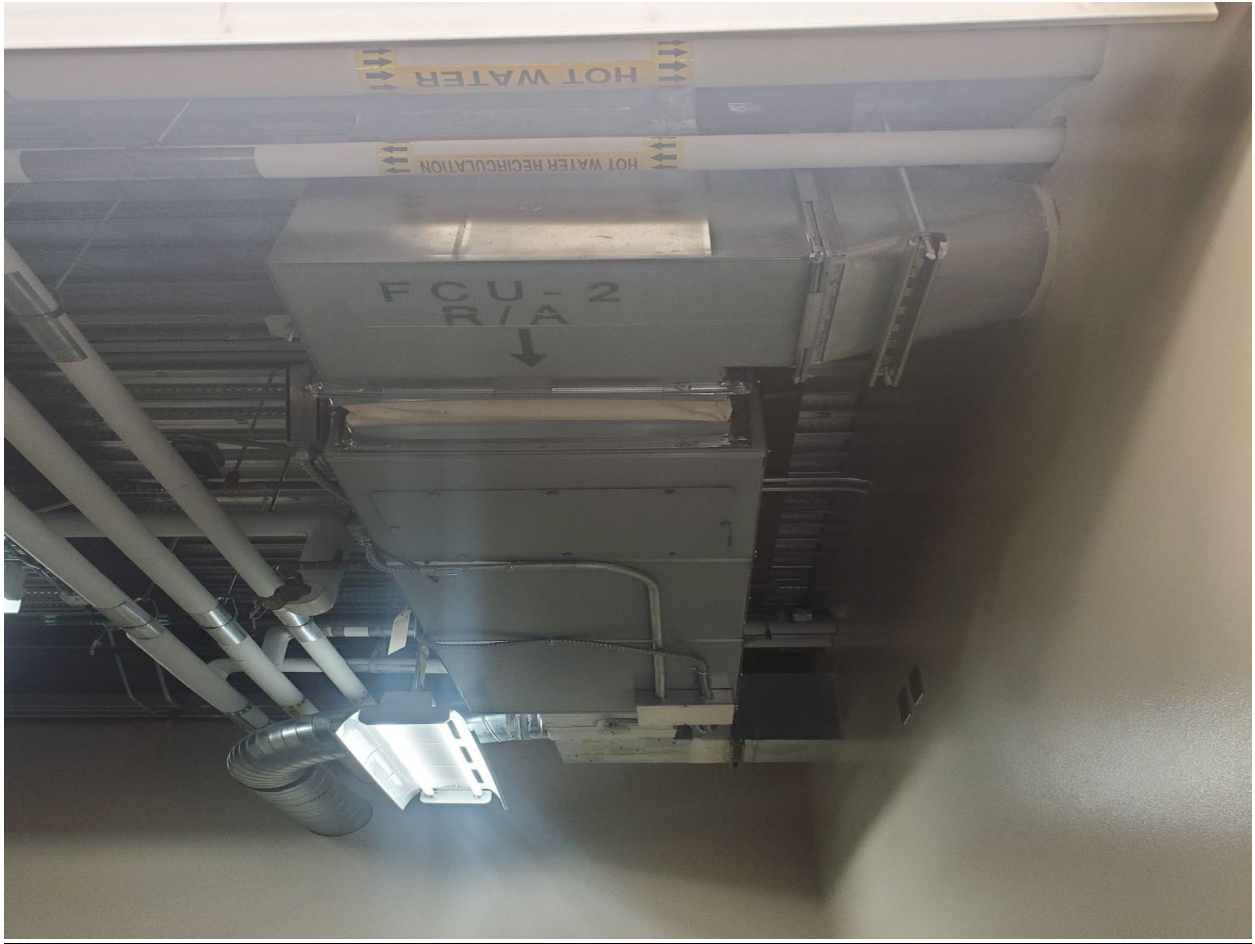
FCU-3 West View