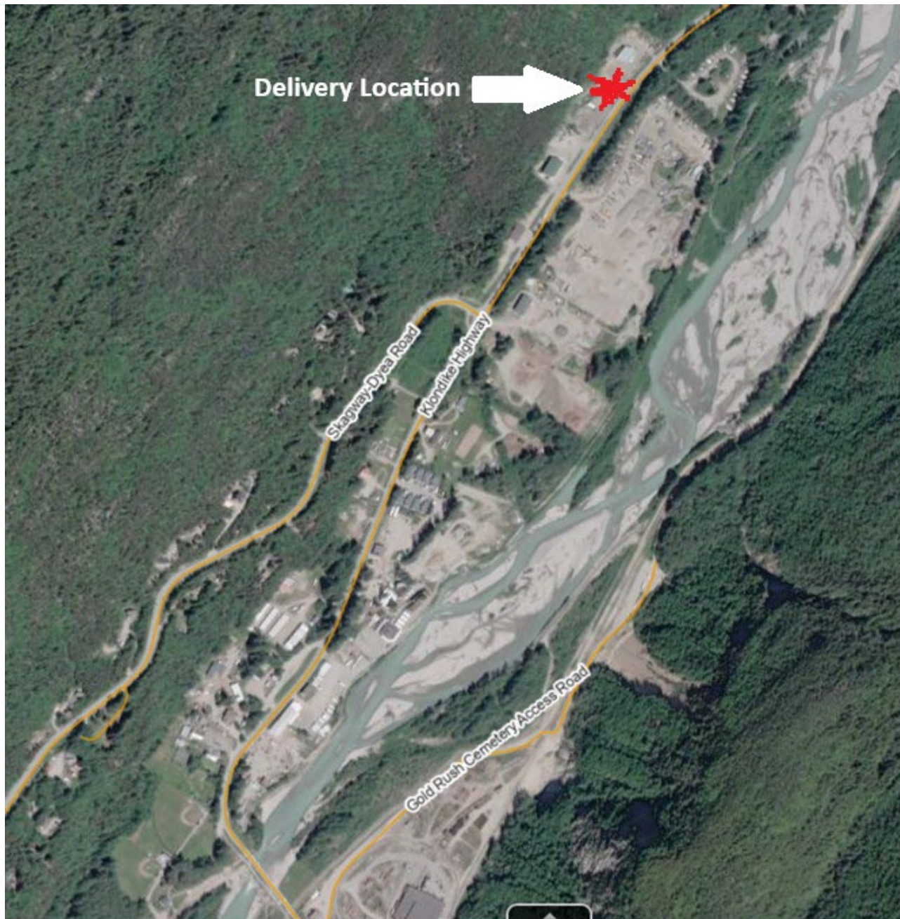
Skagway: Dyea Road Delivery Location