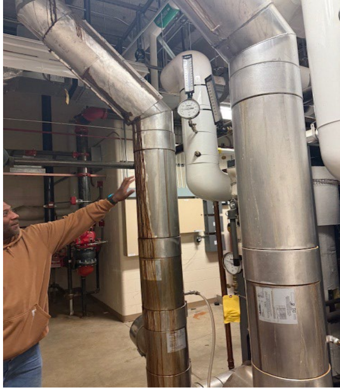
Figure 3. South view