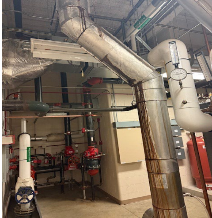
Figure 1. Boiler vent showing fluid leaking out of the assembly