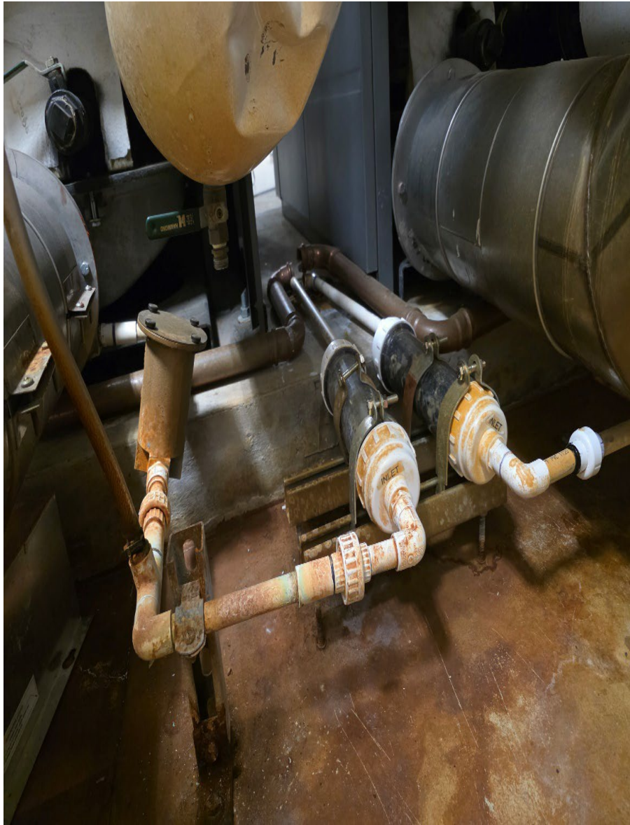
Figure 5. Condensate drain assemblies