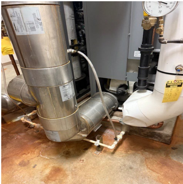
Figure 2. Vent's flange connection to boiler