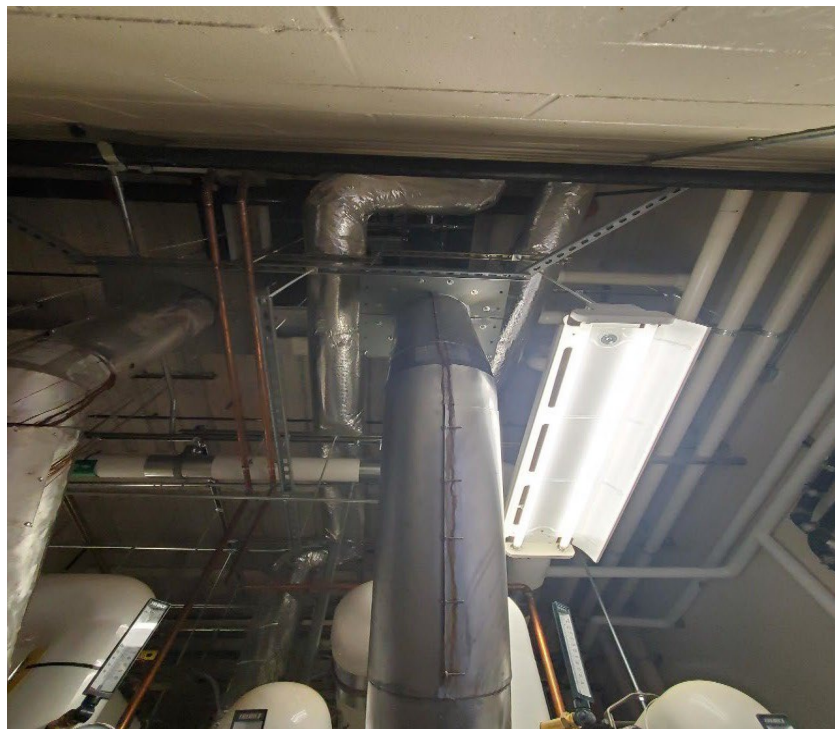
Figure 4. Routing of vent to roof