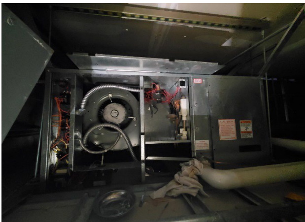
Figure 1 A/C Unit Above Ceiling Tile