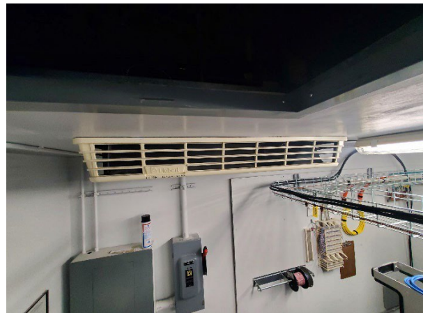
Figure 2. A/C Unit Below Ceiling Tile