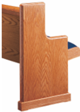
Bench End 302-4109

Upholstered Seat: continuous (no wood breaks along seat)