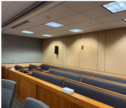
Upper Floor Courtroom