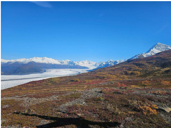
Standing at Dome site