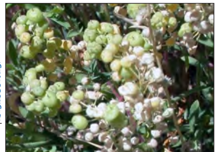
Whitetops and its varieties ( Cardaria draba , C. pubescens , Lapidium latifolium )