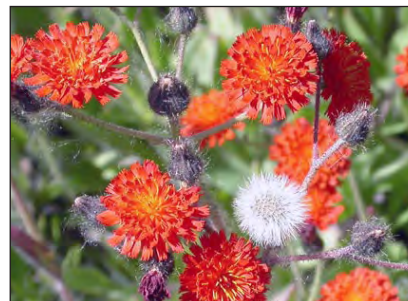
Orange hawkweed ( Hieracium aurantiacum )