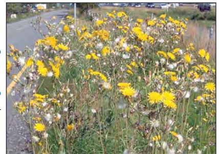
Perennial sowthistle ( Sonchus arvensis )