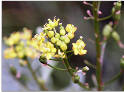
Austrian fieldcress ( Rorippa austriaca )