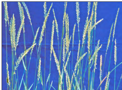
Quackgrass ( Elymus repens )