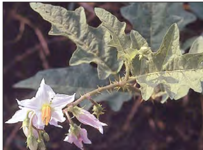
Horsenettle ( Solanum carolinense )