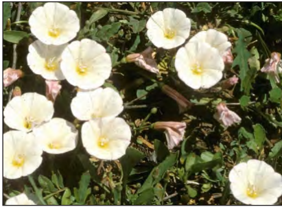
Field bindweed ( Convolvulus arvensis )