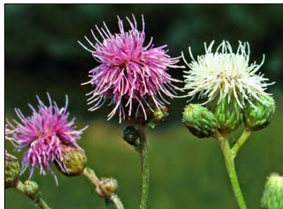
Canada thistle ( Cirsium arvense )