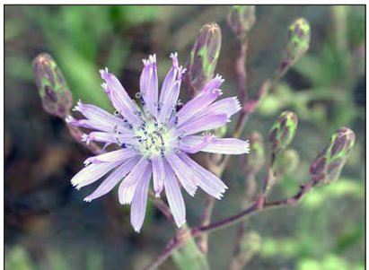
Blue-flowering lettuce ( Lactuca pulchella )