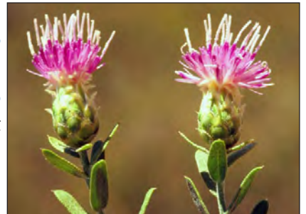
Russian Knapweed ( Acroptilon repens )