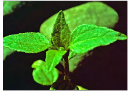
Galensoga ( Galensoga parviflora )