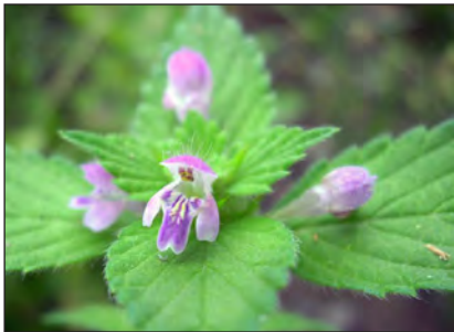
Hempnettle ( Galeopsis tetrahit )