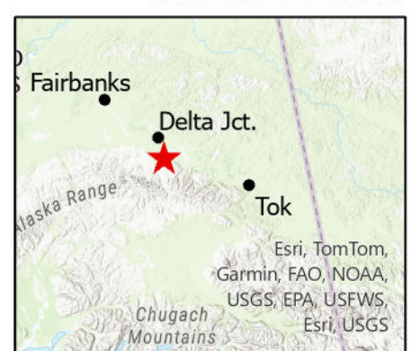
Section 28, Township 13 South, Range 10 East, Fairbanks Meridian