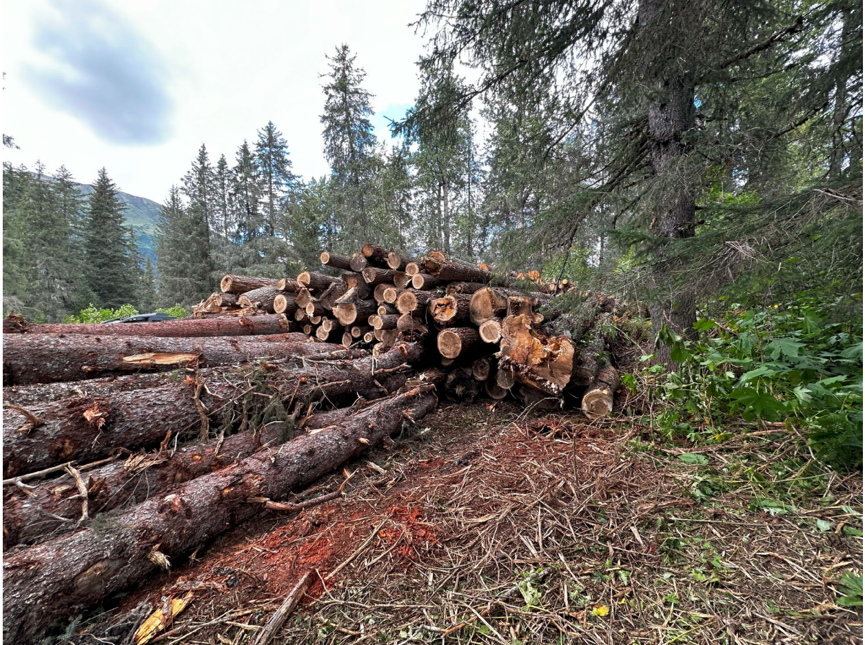
Figure 4 Black cottonwood (right) and the smaller Sitka Spruce (left) log decks.