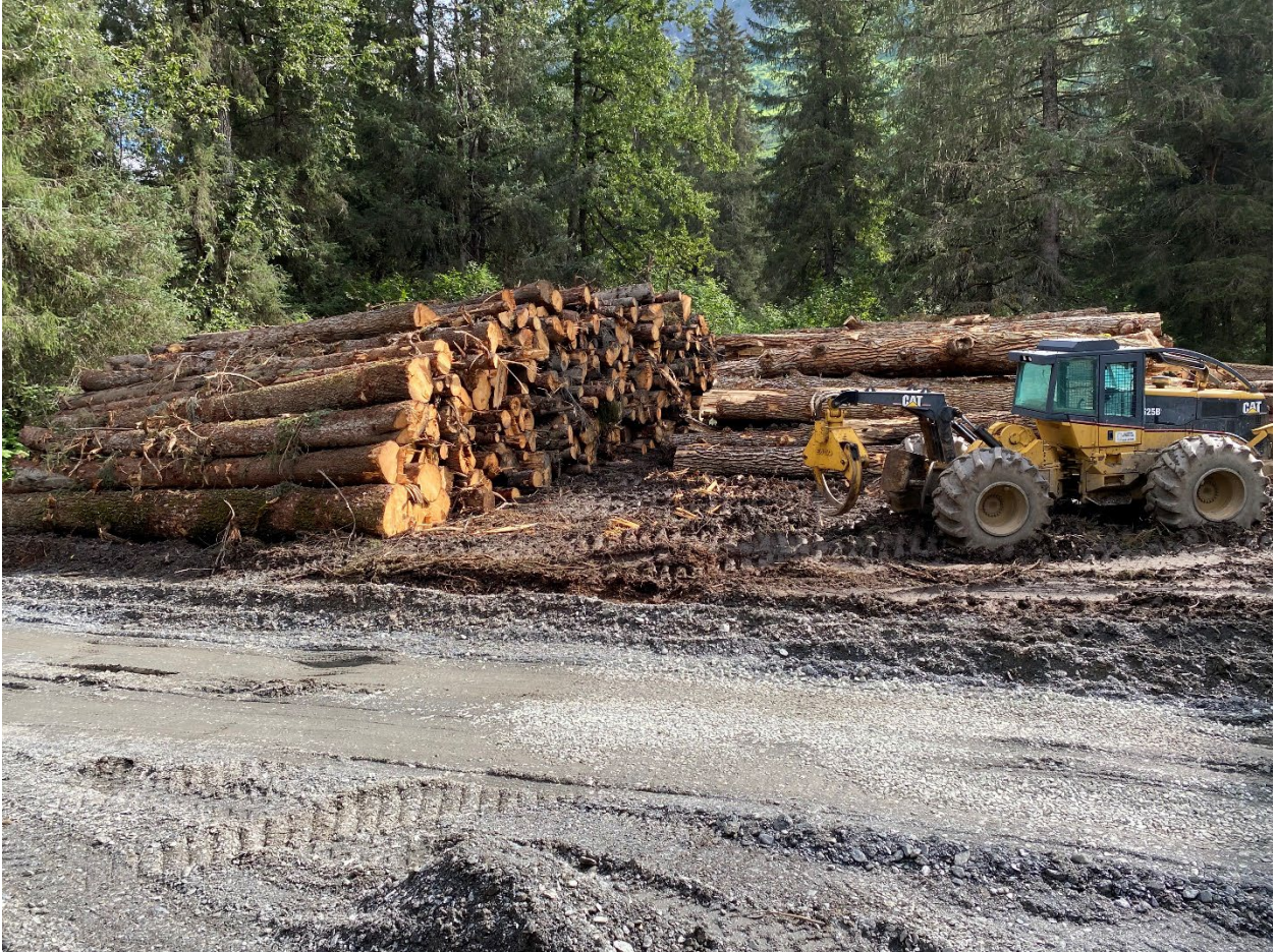
Figure 1 Sitka spruce (left) and black cottonwood (right) log decks on the landing.