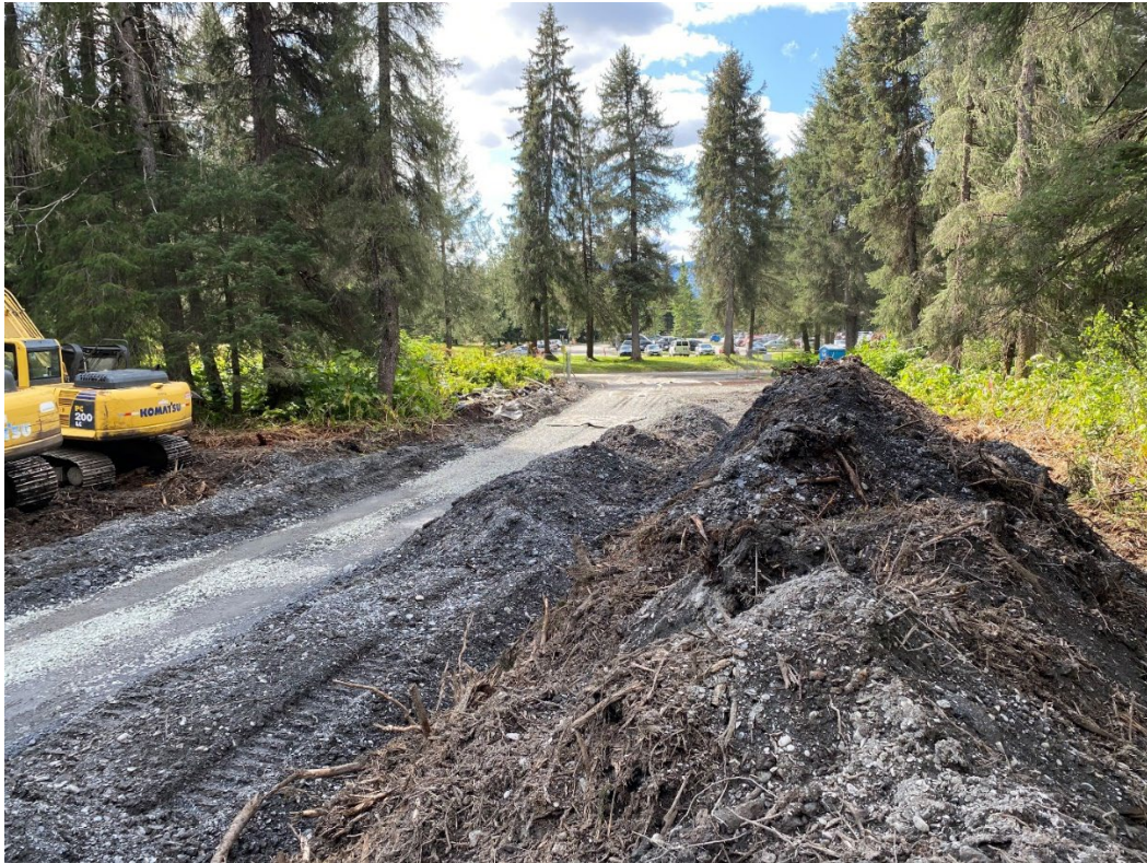
Figure 3 Constructed access from Tram Circle to log decks. Top photo is looking northeast away from Tram Circle, bottom photo is looking southwest towards Tram Circle.