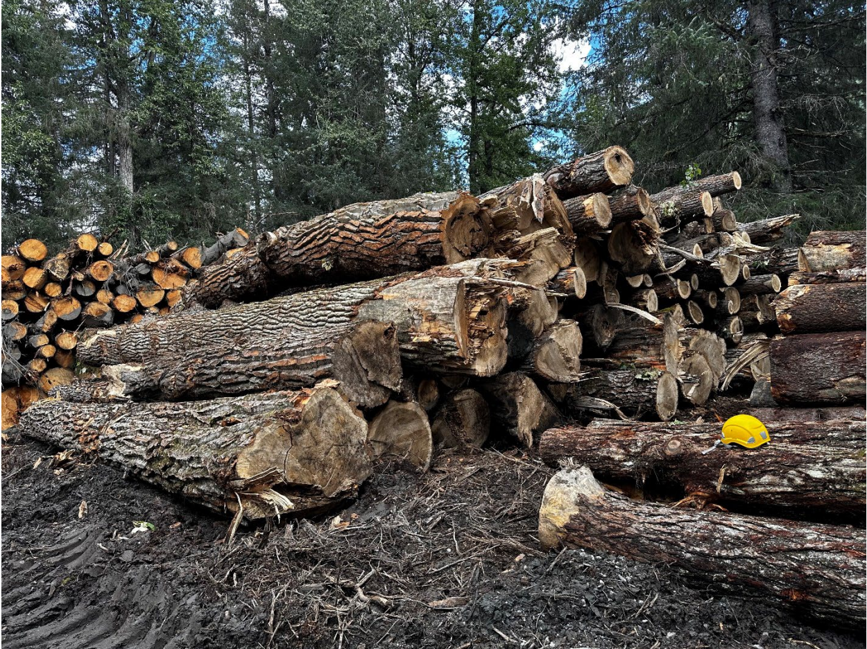
Figure 5 Black cottonwood log deck (center).