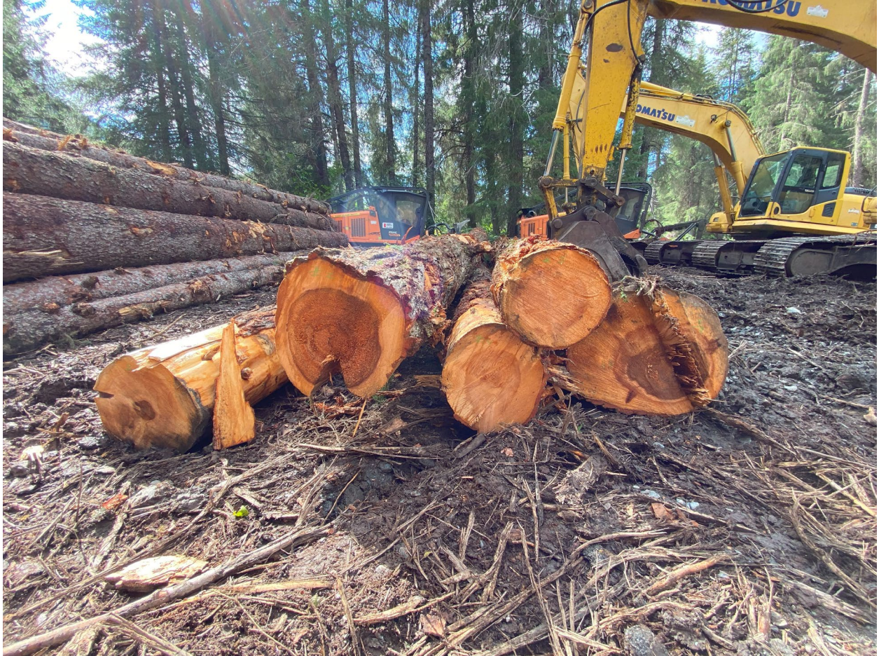
Figure 6 Western hemlock log deck (foreground) with the smaller Sitka spruce deck to the left.