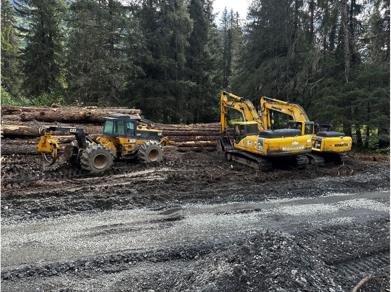
Figure 2 Black cottonwood (left), Western hemlock (right front) and a secondary smaller Sitka spruce (back right) log decks at the landing.