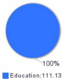
Table 1: MSYs by Focus Areas