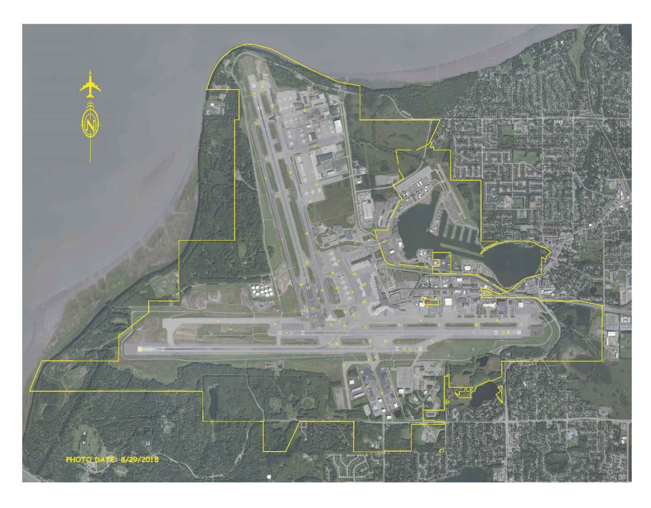
Figure 1 Airport Boundary Map