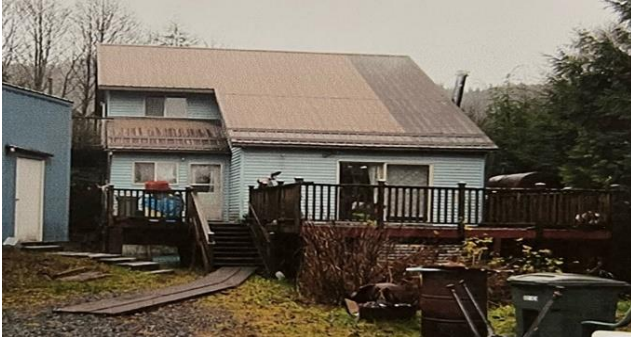
Before ramp installation