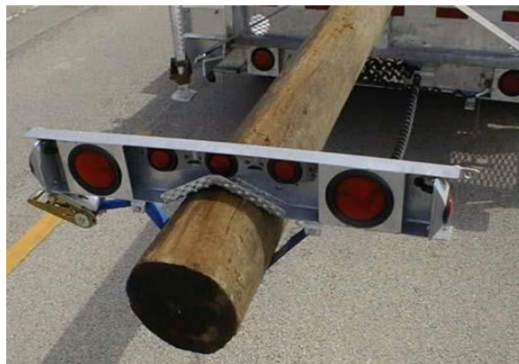
Example of an Extended Light Bar

8.2.2.3 Must have either an extended light bar or a rear pilot/escort vehicle.