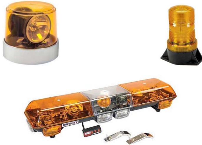
Examples of Approved Amber Beacon and Light Bar

2.6.4 RADIOS: All permitted vehicles requiring a pilot/escort vehicle, except roaded construction equipment and other specialized vehicles, shall be equipped with an operating Citizens Band (CB) radio. Company radios may also be used in addition to the CB radio for inter-vehicle communication.