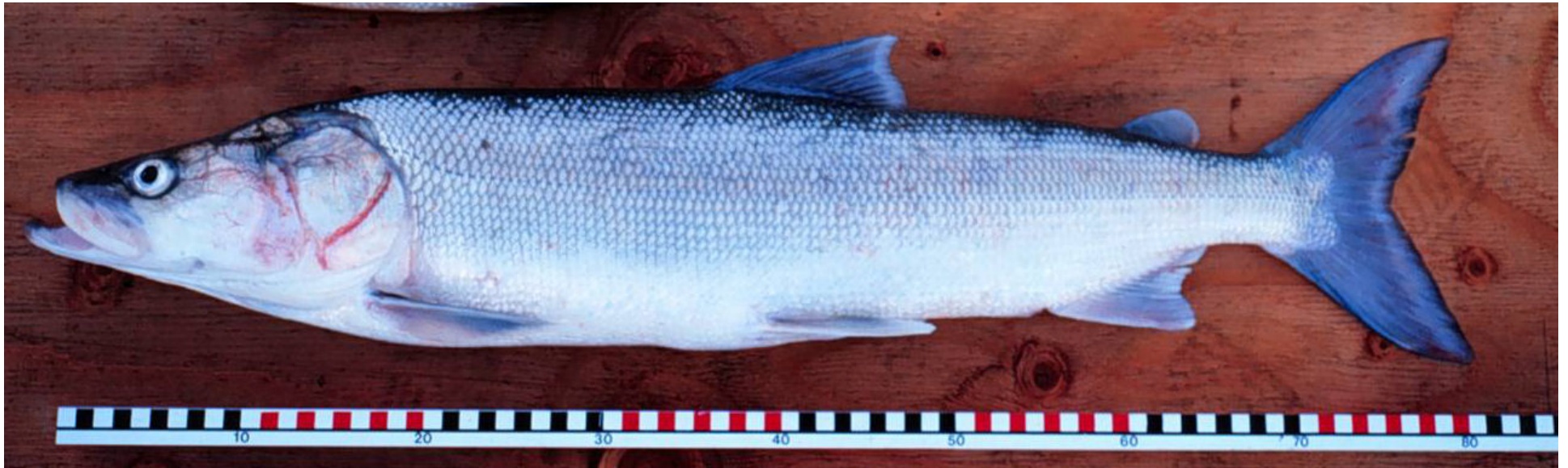
Sheefish/ Inconnu – these may NOT be speared