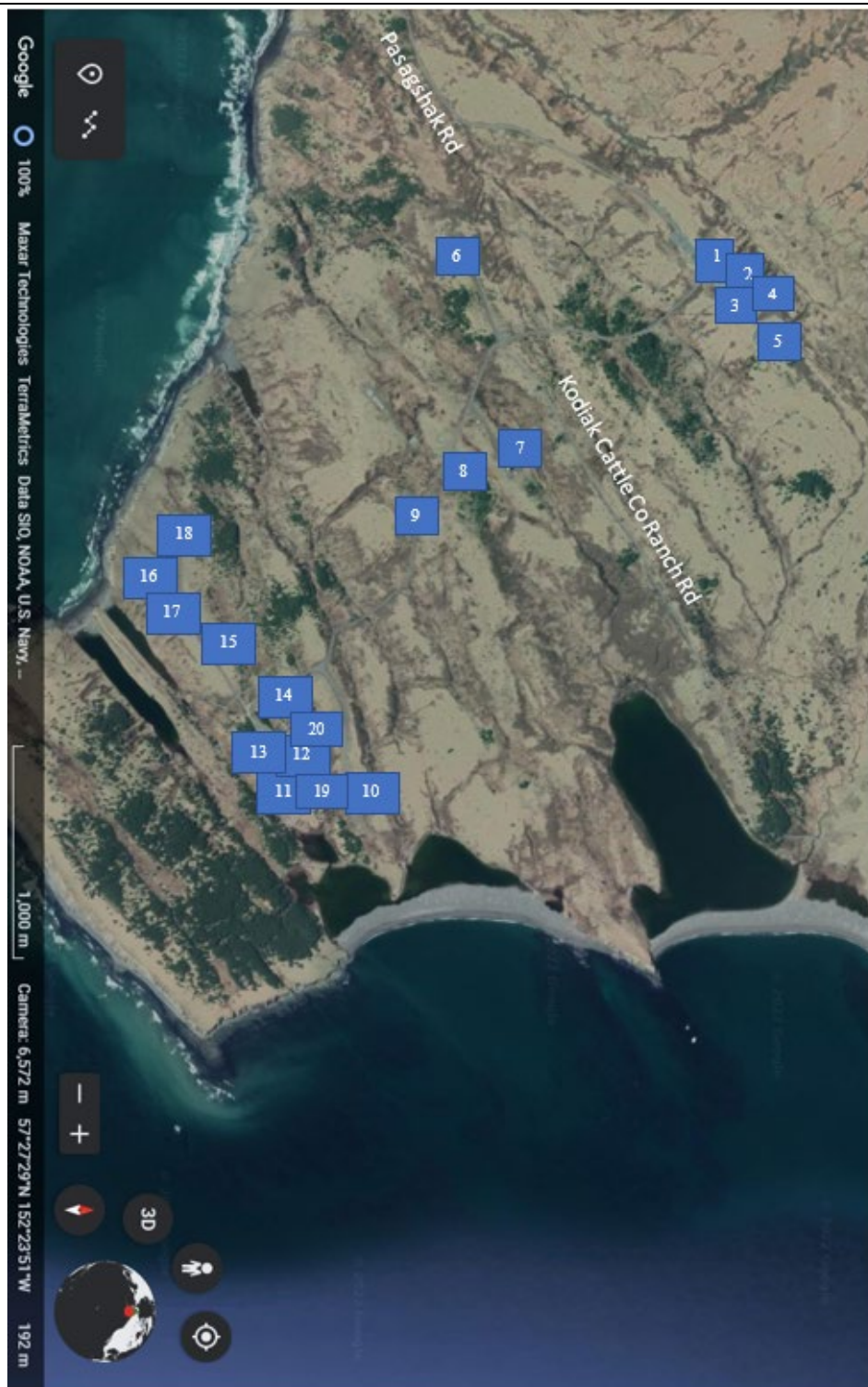
FIGURE 2. EXISTING FACILITIES MAP