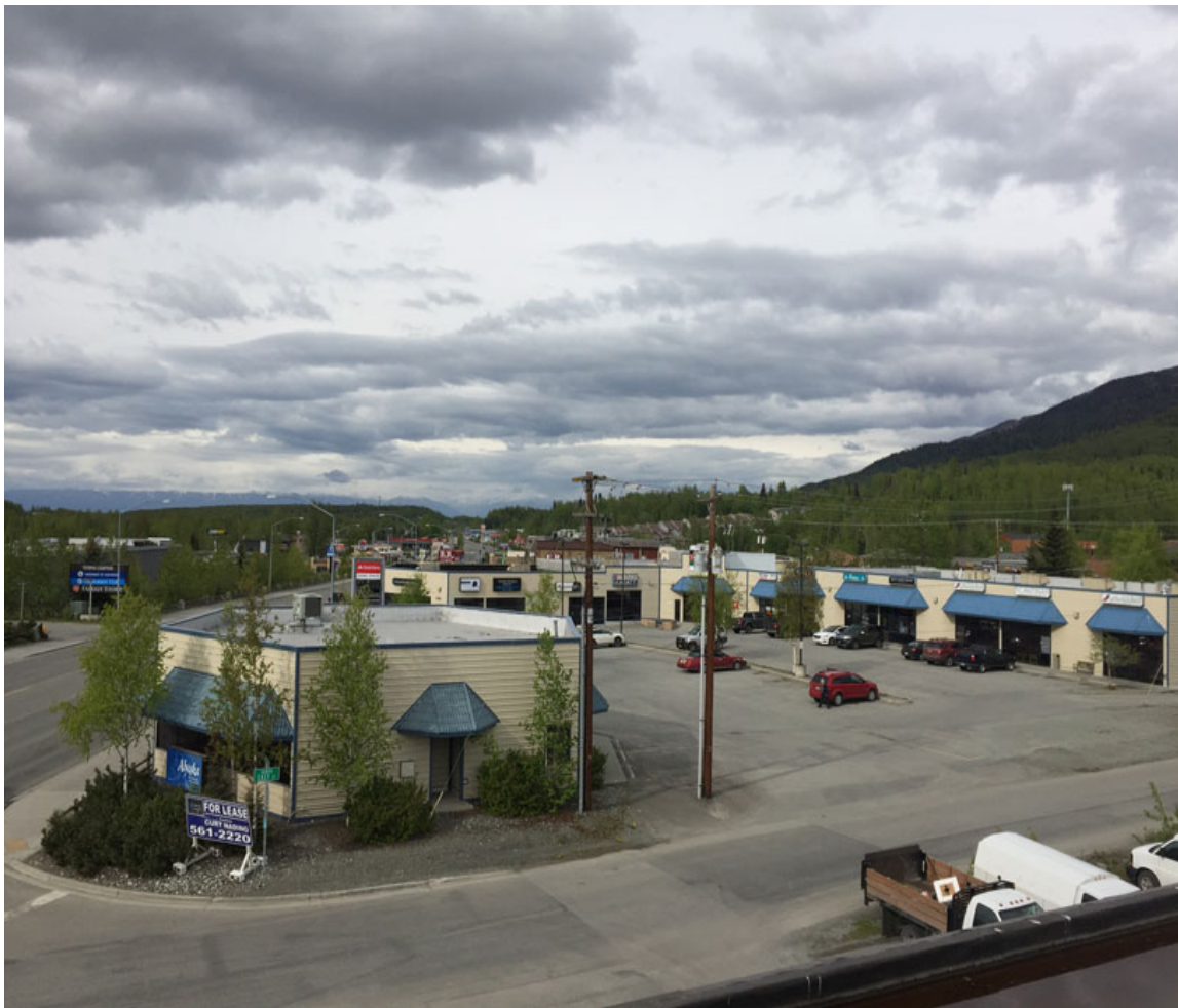
Figure III.D.2-2 Looking North from the Parkgate Site in Eagle River

The PM 10 (SLAMS) monitoring site is equipped with two Met One BAM 1020X monitors – one configured to monitor PM 2.5 and the other configured to monitor PM 10 . The Met One BAM 1020X were installed in October 2008 and were tested for correlation with a collocated FRM PM 10 sampler. Since January 2009, the DEC and MOA have been submitting PM 10 and PM 2.5 hourly data from these monitors.