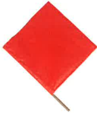
Approved Red Flag

2.6.2 FLAGS: When specified, shall be square and a minimum of 16 inches on each side. Flags must be kept clean and clearly visible during the entire trip. They must be either red or fluorescent orange in color.