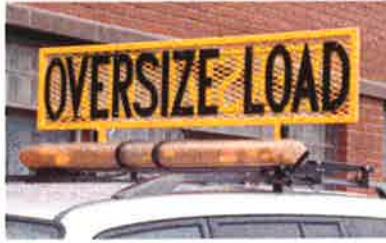
Approved Manufactured Sign