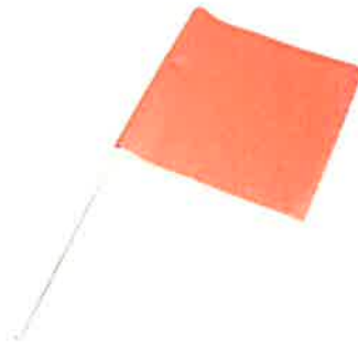
Approved Fluorescent Orange Flag

2.6.3 BEACONS: When specified, the permitted vehicle's beacon or light bar shall be amber in color and shall be of a high-intensity rotating, flashing, oscillating, or strobe style. The beacon shall be roof mounted or mounted as close to the vehicle's roof line as practical. The beacon/strobe shall be visible for a minimum of 500 feet, shall be visible through a full 360 degrees, and shall be maintained for operability.