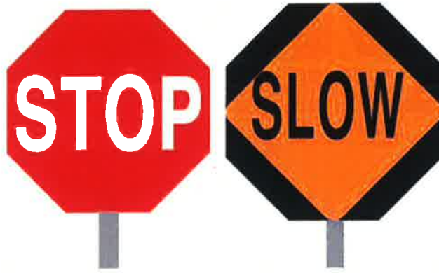
Approved Stop/Slow Paddles