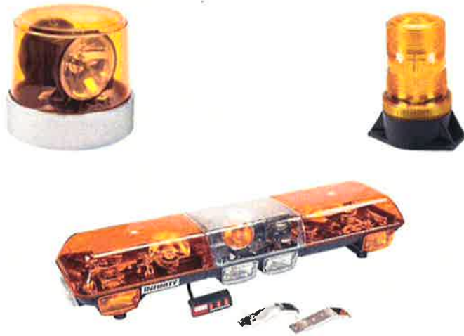
Examples of Approved Amber Beacon and Light Bar

2.6.4 RADIOS: All permitted vehicles requiring a pilot/escort vehicle, except roaded construction equipment and other specialized vehicles, shall be equipped with an operating Citizens Band (CB) radio. Company radios may also be used in addition to the CB radio for inter-vehicle communication.