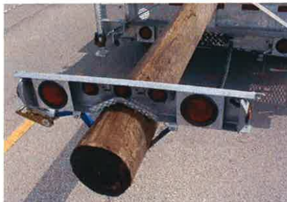
Example of an Extended Light Bar

8.2.2.3 Must have either an extended light bar or a rear pilot/escort vehicle.