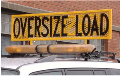
Approved Manufactured Sign

2.6.1.3 Lettering shall be a minimum of 10 [TEN] inches tall with a two inch brush stroke.