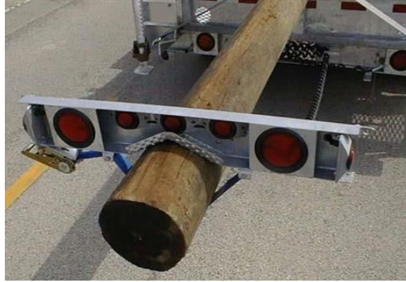
Example of an Extended Light Bar

8.2.2.4 [SLOW MOVING VEHICLES (25 MPH OR LESS) A] A re subject to peak traffic [AND HOLIDAY] restrictions.