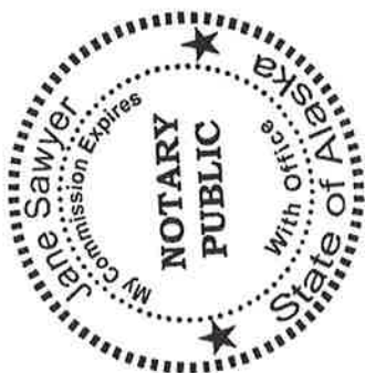
Notary Public in and for the State of Alaska