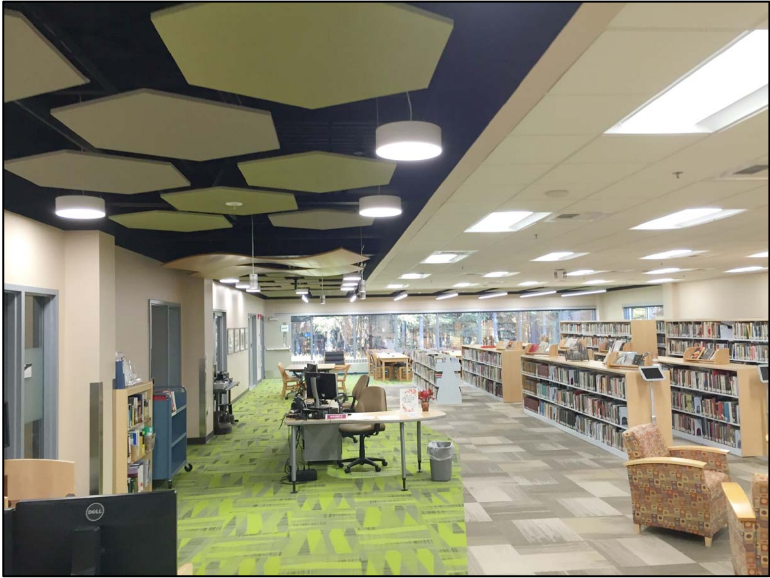
2 CEILING W/ EXPOSED DECK & "CLOUDS" A6 NTS