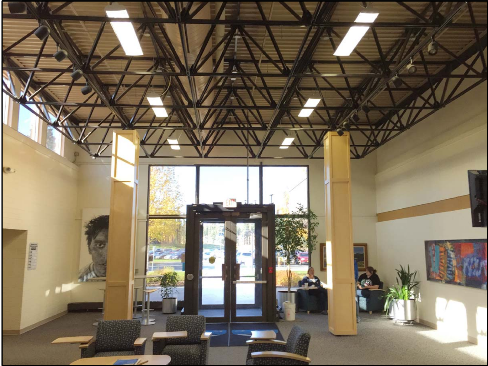
3 CEILING W/ EXPOSED DECK A6 NTS