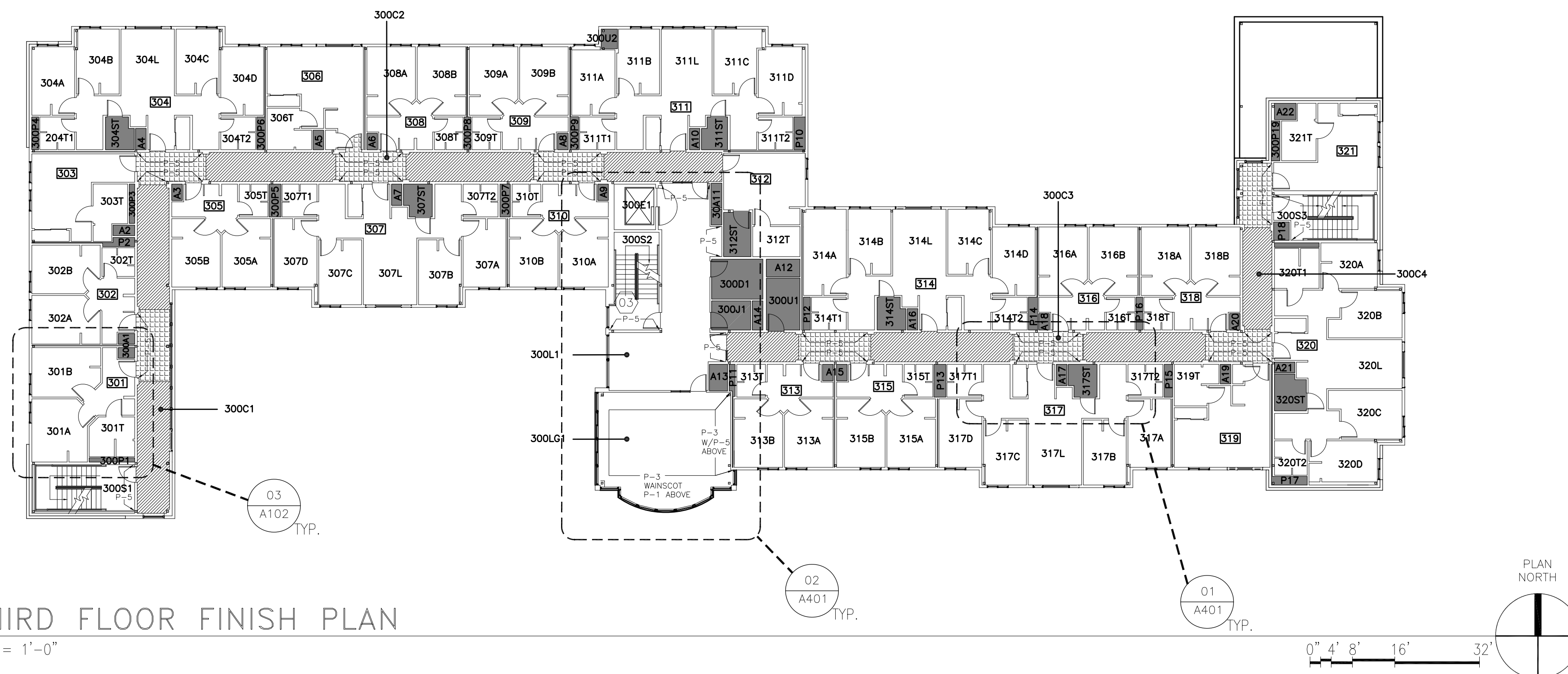
01 THIRD A102 1/16'' = 1'-0''