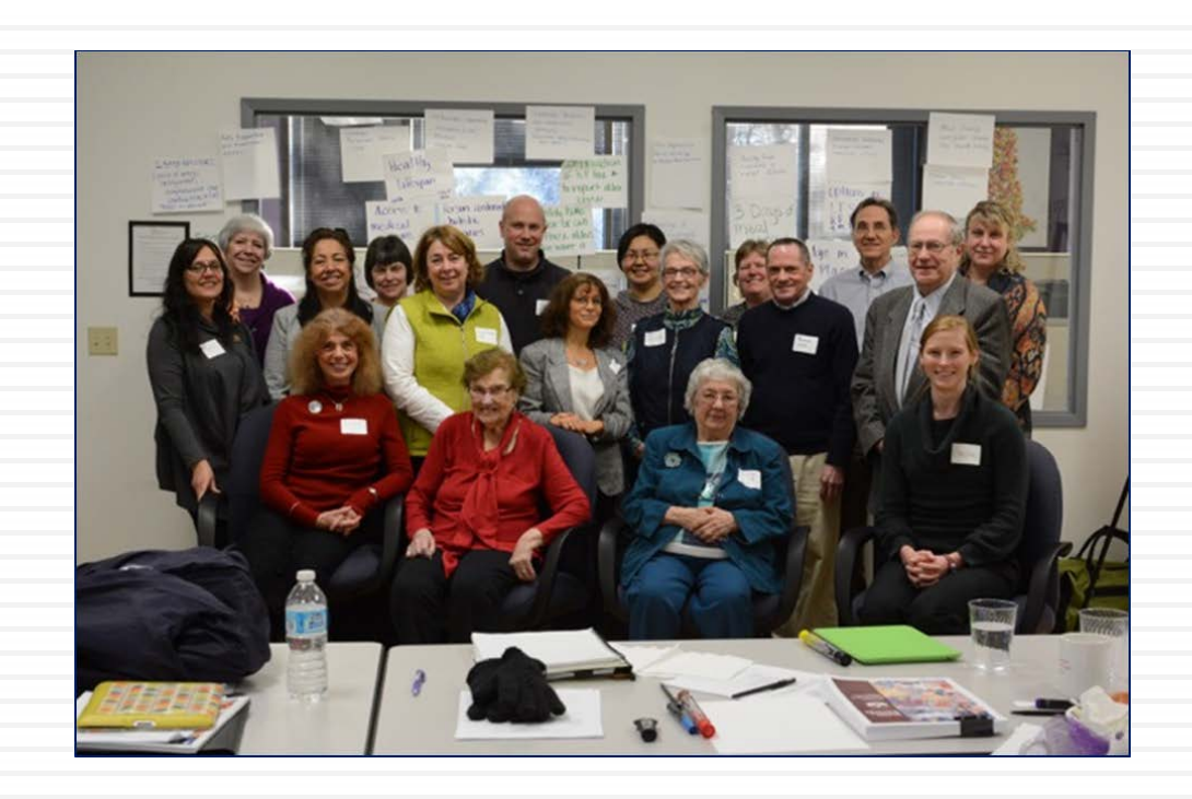
The Alaska State Plan for Senior Services Advisory Committee