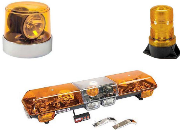
Examples of Approved Amber Beacon and Light Bar