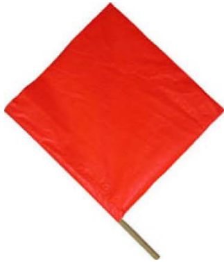
Approved Red Flag