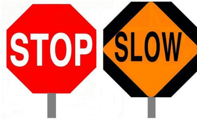
Approved Stop/Slow Paddles