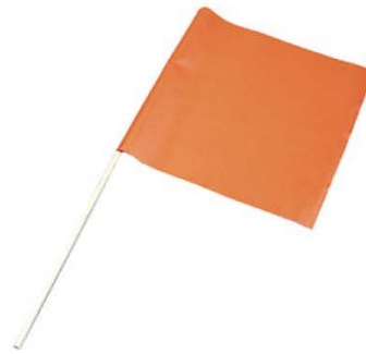
Approved Fluorescent Orange Flag