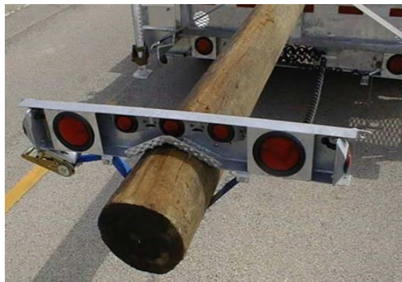
Example of an Extended Light Bar

8.2.2.3 Must have either an extended light bar or a rear pilot/escort vehicle.