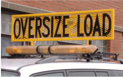
Approved Manufactured Sign