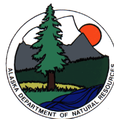
EXHIBIT B SSE-1345K VALLENAR BAY TIMBER SALE Unit 4 & 5