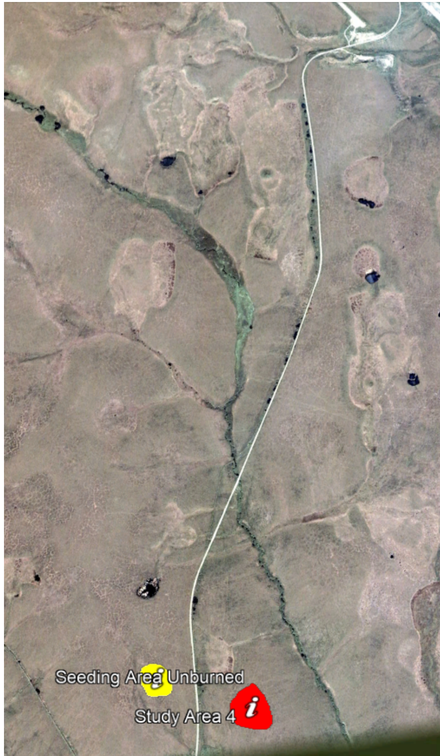
Study area 4 and Unburned seeding area. Quartz Creek air field is shown to the north.