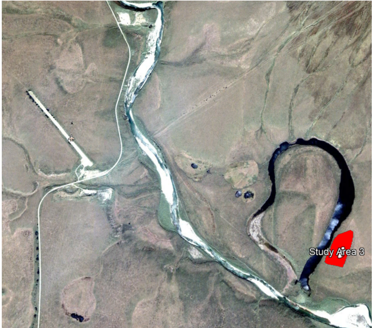
A close up of Study area 3 with road and Quartz Creek air strip for reference.